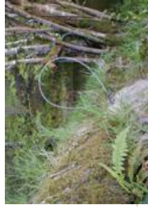
Snare near river bank, Edwinstford Estate

For example, visits by League investigators during 2004 and spring 2005 uncovered a number of snares set along the banks of the River Cothi where they could easily entrap otters. The Wildlife Trust confirms there is a very healthy otter population on the river. 38 The BASC code of practice on the use of snares states: "Avoid setting snares on tracks alongside rivers and water courses". This guidance is echoed by the Game Conservancy Trust which advises: "Do not set snares close to rivers where otters are found" 39 .