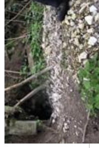
Badger sett close to snares at Littlecote Estate