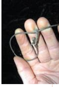
A kink in this snare found on the Bradenham estate makes it essentially self locking.