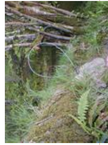
Snares set on riverbank, posing a threat to otters, Edwinstford, May 2006