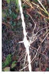
Snares set on badger run, Brudenham estate 2005