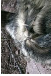
Snared badger, Llanthony estate 2004