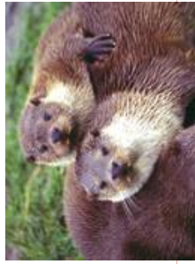
Always look for any signs of otter activity