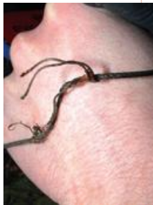
Frayed snare, Ranton Abbey Estate, 2005