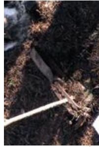
One of five illegal gin traps found on the Cawdor estate in February 2004.