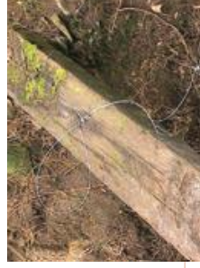
Snares set on bridge over a stream – a snared animal would be left hanging in the water