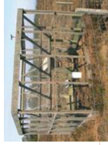
Multi trap, designed to catch birds at Cawdor Estate

The number of dead mountain hares is of particular concern. Mountain hares are a vulnerable species, listed as 'of community interest' in Annex V of the EU habitats directive (1992). 50 Various, often spurious, rationales are offered to justify killing mountain hares on shooting estates and grouse moors. Not surprisingly maximising profit by eliminating all perceived threats to gamebird populations is never given as an excuse.