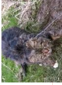
A terrified cat captured in one of the snares, Edwinstford

It is clear from this inadequate result that responsibility for wildlife crimes must ultimately rest with the owners of shooting estates.