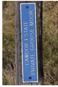
Sign outside Cawdor Estate

That same month a widely reported League investigation of the Cawdor shooting estate 46 near Inverness revealed a widespread programme of wildlife persecution including the use of five illegal gin traps – heavy steel devices with razor sharp teeth which were outlawed over 30 years ago – set in a circle around rabbit carcasses left out as bait. Gin traps do not kill their victims outright, but hold them in place until they are found, causing great suffering and distress. Animals have previously been reported to chew off their own trapped limbs in a desperate bid to struggle out of gin traps. 47