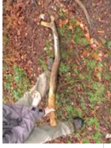
One of many snares found on dragoles, Bradenham estate.