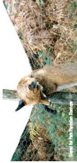
Snared fox Park Himation Stanbury