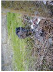
Cat lured into snare by field pheasants, Edwinstford