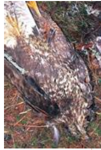
Buzzard poisoned with carbofuran found by League investigators on the Cawdor Estate in 2004.

Investigators also obtained evidence of extensive snaring at the estate with dozens of wire snares filmed near gamebird pens, including snares attached to wooden dragpoles which contravene the BASC code of good practice for snaring and the spirit of the Wildlife and Countryside Act. The League investigator, who obtained video film at the Cawdor Estate, said: "The sheer density of snaring we've witnessed effectively turns this area into a death trap for wildlife. I'd be surprised if there are any wild creatures left in such a hostile environment."