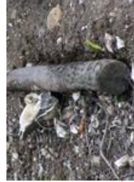
Snares set on dragpole near badger sett, Clarendon