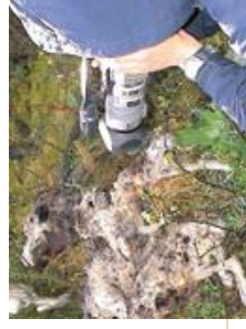
Dead hares found surrounded by snares.