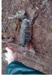
Badly decomposed rabbit in snare, Llanthony Court February 2004