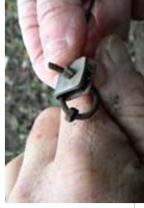
Amateur snare with sharp edges and no stop