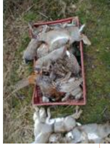
Dead pheasants and rabbits used to lure animals into snared enclosure.