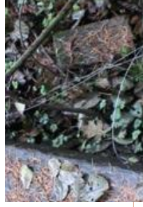
Snares set beside deep drop

At Ranton Abbey sharp, homemade snares were found with no 'stop'. The sharpness of these amateur snares is almost certain to cause injury and the lack of a stop increases the likelihood of strangulation. One of these snares showed signs of a previous struggle with an animal: some of the strands on the snare were broken and there was flesh and fur attached to the strands. Clearly, a snare without a stop – particularly an amateur variety such as those found at Ranton Abbey – is much more likely to cause injury.