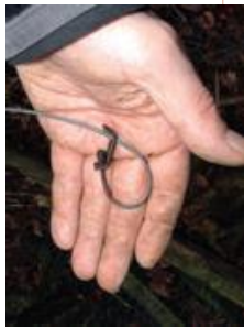
Snares with no 'stop' - one of many found on the Brudenham estate