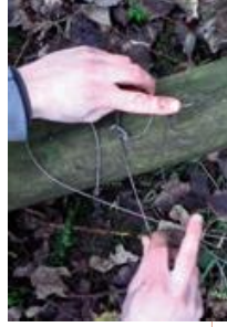
3 snares found on one drag pole

The number one item in the BASC code of practice on snaring is: "Only free running snares which contain a 'permanent stop', 9" from the eye of the snare should be used". 12 Without this 'stop' or locking device, the wire noose will cut deeper and deeper as the captured animal struggles until eventually its flesh could be ripped open.