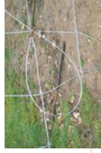
Snares set in fence line near badger sett, Brudenham