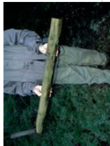
Snares on draggables - Brudenham estate