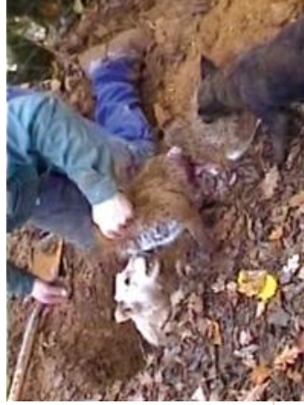
A 2004 League Investigation exposed the cruelty of terrierwork

were regarded as a sign of a good terrier. 81 Some terriermen have been successfully prosecuted for failing to seek veterinary treatment for terriers injured in such encounters.