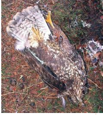
A buzzard poisoned with carbofuran found by League investigators on the Cawdor estate, 2004.

Cost of grouse shooting to protected and endangered birds of prey? Incalculable.