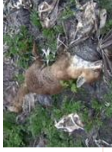
Dead fox dumped in pen with dead pheasants, Edwinstford, Wales.