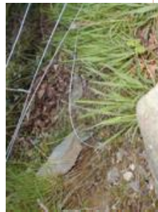
Snares hanging on ground, Edwinston, May 2005 (limbs were in the field on the other side of the fence)